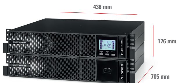
SLC 4000-10000 TWIN RT2