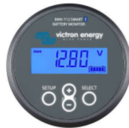
BMV-712 Smart Battery Monitor