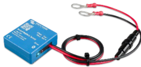
Smart Battery Sense Enables temperature and voltage compensated charging.