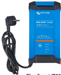
Blue Smart IP22 12/30 (3)