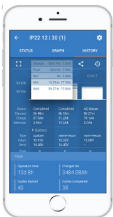
One of the history screens