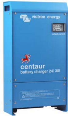
Centaur Battery Charger 24/30