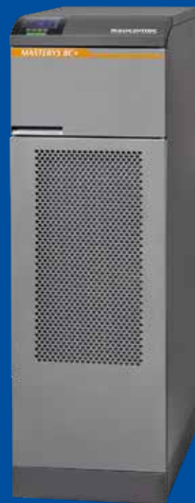
MASTERYS BC+ 60-80 kVA External battery