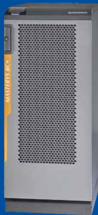
MASTERYS BC+ 100-120 kVA External battery