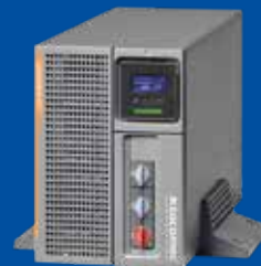
MASTERYS BC+ 10-40 kVA External battery