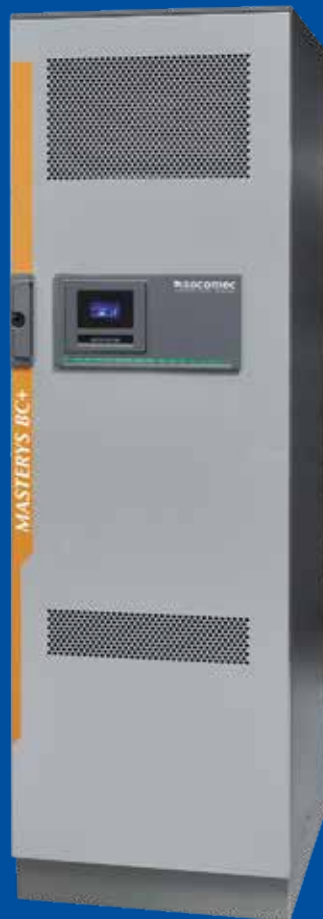
MASTERYS BC+ 60-80 kVA Internal battery