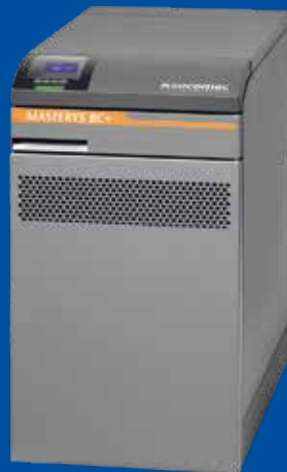
MASTERYS BC+ 30-40 kVA Internal battery