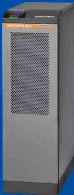
MASTERYS BC+ 10-20 kVA Internal battery