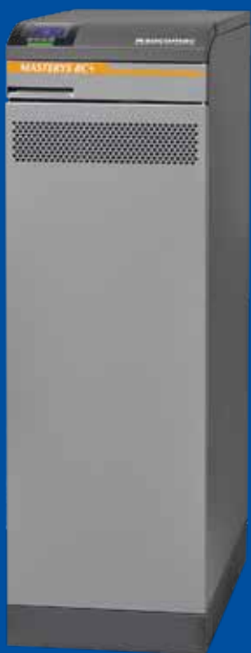
MASTERYS BC+ 10-40 kVA Internal battery