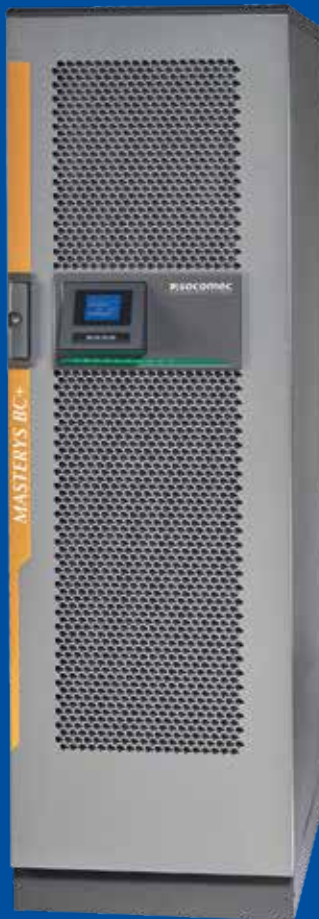
MASTERYS BC+ 160 kVA External battery

The new generation of MASTERYS BC+ UPS is a cost effective solution, comprising a wide range of Power Factor 1 UPS (10-60 kVA), that are easy to configure and order, and has been designed to meet specific customer needs within SMEs, commercial, light industrial and public sector organisations.